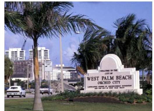
Signage for the City of West Palm Beach